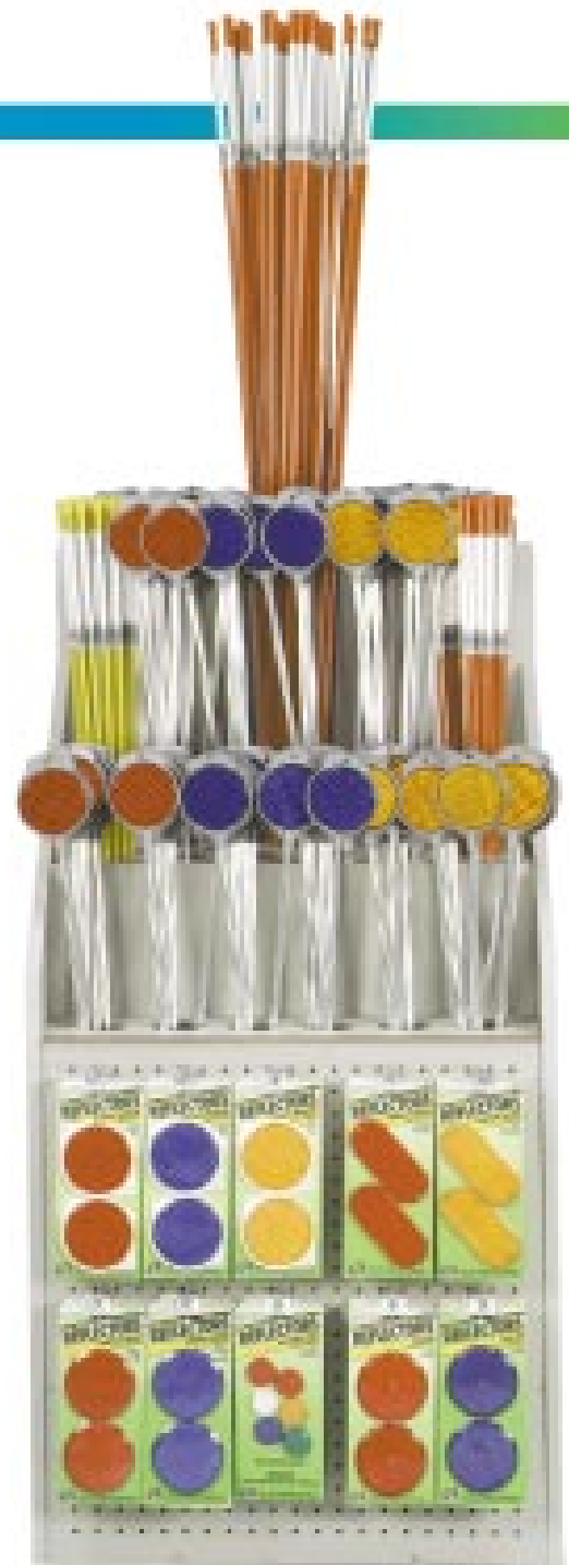
N14 2 Ft. Safety Marker & Reflector Display

Hy-Ko Products Company 330•467•7446 800•292•0550 Fax: 330•467•7442 • E-Mail: cservice@hy-ko.com • www.hy-ko.com