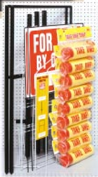
N13 2 Ft. Sign Frame Center