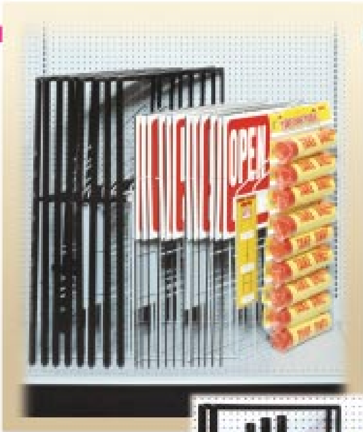
N12 4 Ft. Sign Frame Center