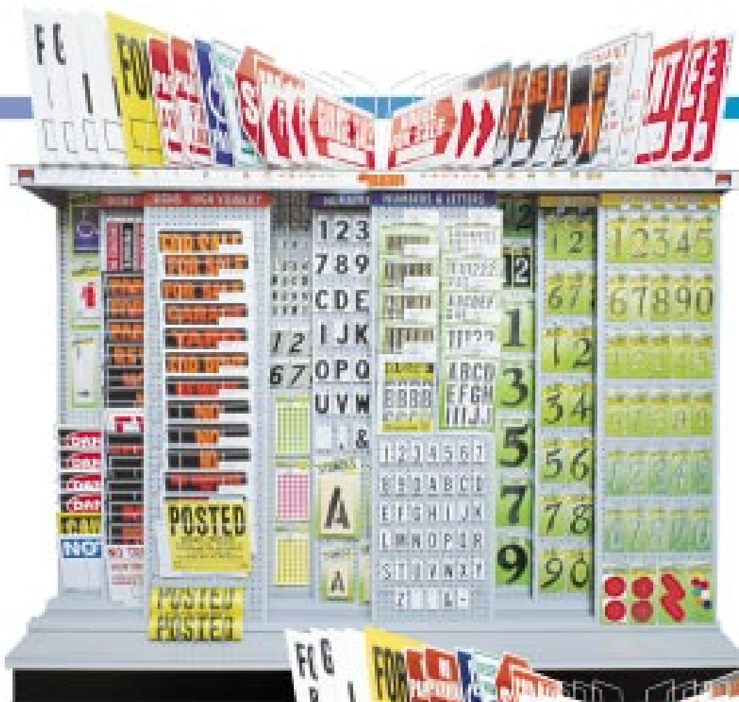
M5 8 Ft. Slider Program