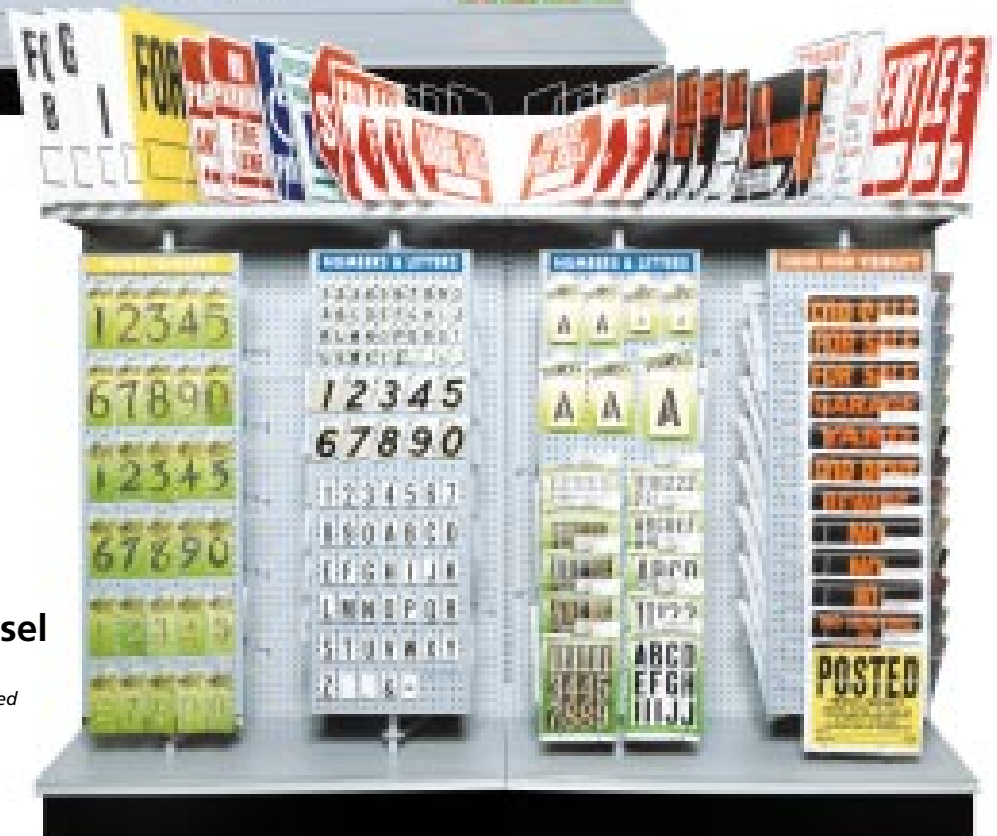
M6 8 Ft. 4-Carousel Program Carousels can be purchased separately.